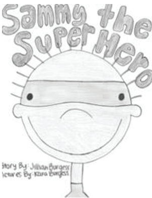
Figure 2: Sammy the Superhero Cover

The main guideline I kept in mind while writing was what I was going to teach my audience, since I learned from my research that morals are an important part of a children's book and good values are important to superhero stories. Since I was creating a superhero picture book and morals and good values were important to both picture books and superhero stories, I made sure to focus on that while writing my story. So, I made sure that Sammy learned something by the end of the book. After Sammy tries to fight the bad guys by himself, he realizes that it is always okay to ask for help. Although this lesson is very simple, it is a good moral for children to learn.