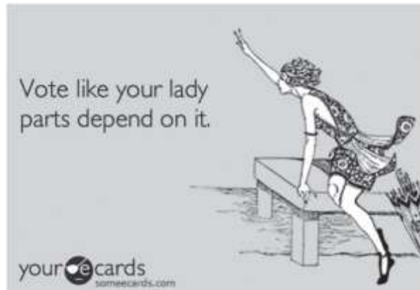
Figure 1. An image I liked and shared on Facebook ("Vote").

I've never met the person who originally posted this image. Most who had also belonged to this Facebook group (meaning they had liked this group sometime in the past and had not un-liked this group since that decisive digital move) and who were moved to respond to this post in some way gave rave reviews and favorable comments. I liked it so much I shared it on my wall. About an hour later, one of my friends posted the image