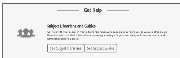
Figure 4: A screenshot of Milner Library's "Research" web page.